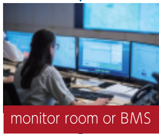
monitor room or BMS