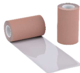
Conductive bonding film

For inquiries regarding this matter, please contact the Sales Department, Functional Material Division, at TEL +81-774-66-5551.